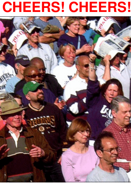
UCONN Women's Basketball coach Geno Auriemma gets a big Victory Parade hoot.